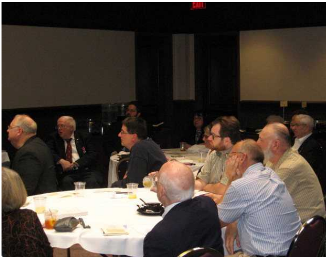
View of captive audience