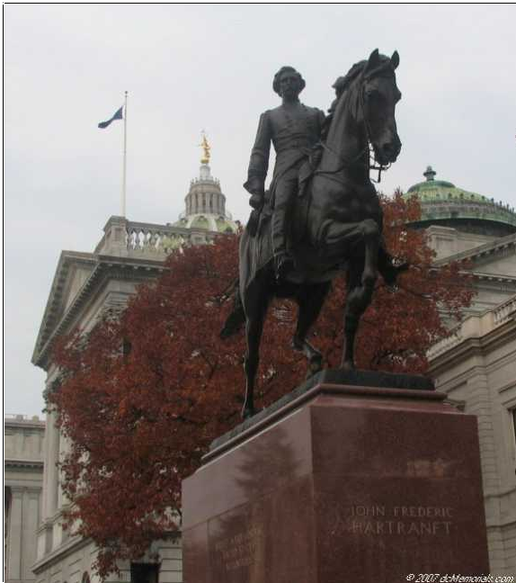
MODERN VIEW OF RELOCATED MONUMENT.

1905 POST CARD VIEW OF MONUMENT LOCATED ON GROUNDS OF THE CAPITOL COMPLEX ALONG 3 RD STREET DOWNTOWN HARRISBURG.