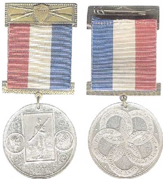
First Defenders Medal Type 2

Regulars left the column and moved off towards Fort McHenry, leaving the practically unarmed volunteers to proceed as best they could. Proceed they did, amid in excellent order, considering their inexperience. Although being continually threatened by the mob, and four of their number bleeding from wounds inflicted by hurled cobblestones, the volunteers finally entered Washington at dusk that evening, and were quartered in the Capital. A few hours later they were marched to the basement of the building, where they were issued new rifles, accoutrements and ammunition. Here they were visited by President Lincoln, who went down the line and shook hands with every man, thanking them for the promptness with which they had answered his call to The Colors.