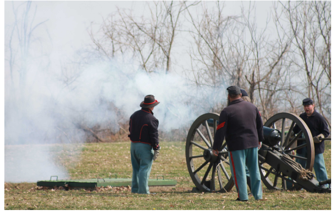
--- BA BOOM---