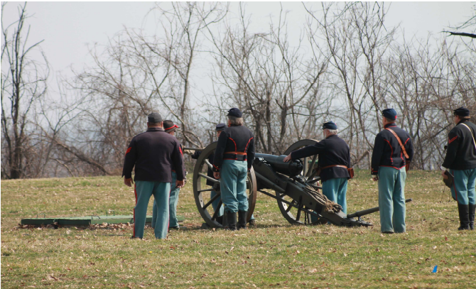
PREPARING TO FIRE