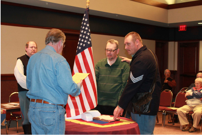
AT THE APPROPRIATE TIME OF THE MEETING, THEY