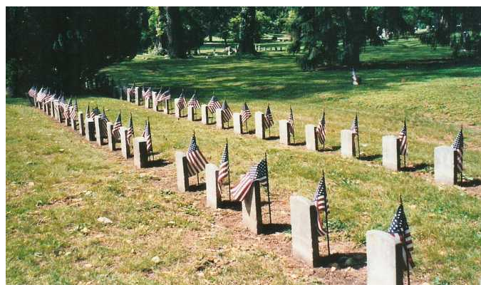
AND VETERANS ARE BURIED THROUGHOUT CEMETERY.

Commemorative Bricks , associated with the Allied Orders' Sons of Union Veterans of the Civil War and Camp 15, installed at National Civil War Museum, east side patio, 'Friends Walkway', over looking 'old wells' of Reservoir Park are displayed next: