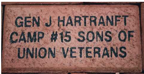
CAMP 15 SONS OF UNION VETERANS OF THE CIVIL WAR