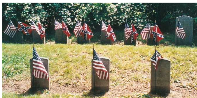
AMERICAN LEGION AND CAMP 15 HONOR "VETERANS ROW" AT HARRISBURG CEMETERY.