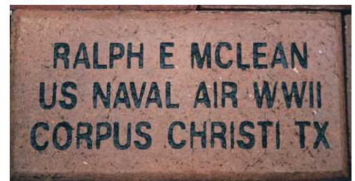
VETERAN AND CAMP 15 MEMBER RALPH MCLEAN