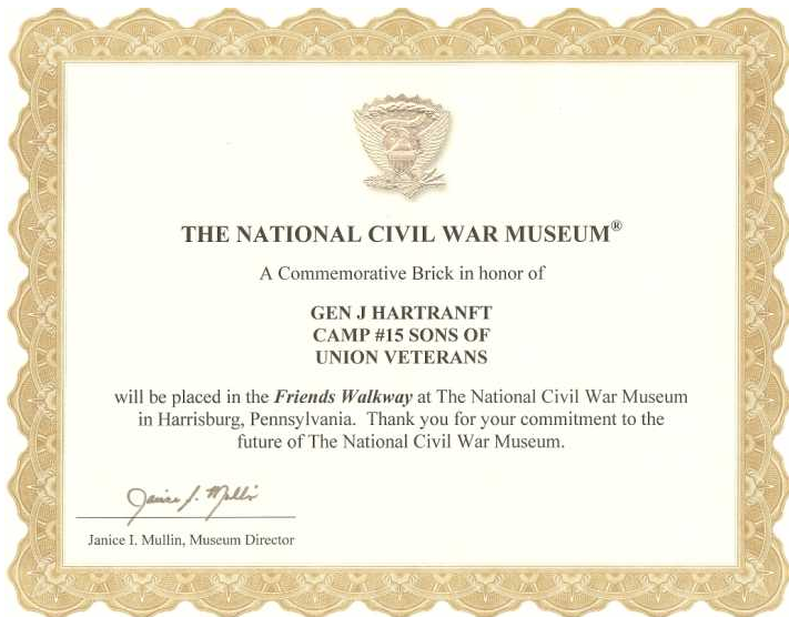
CAMP 15'S CERTIFICATE OF OWNERSHIP AND THE BRICK: