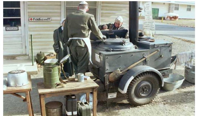
AUTHENTIC GERMAN CHUCK WAGON. OPERATORS FEED FIRE-BED WITH WOOD OR COAL TO HEAT SOUP OR STEW UNDER THE SUBMARINE-LIKE HATCH. P.S. THE INTERIOR OF THE COOKING UNIT WAS SPOTLESS AFTER 68 YEARS OF FIELD USE. WE HAD INSPECTED IT IN JANUARY 2007. A MARVELOUS MACHINE!