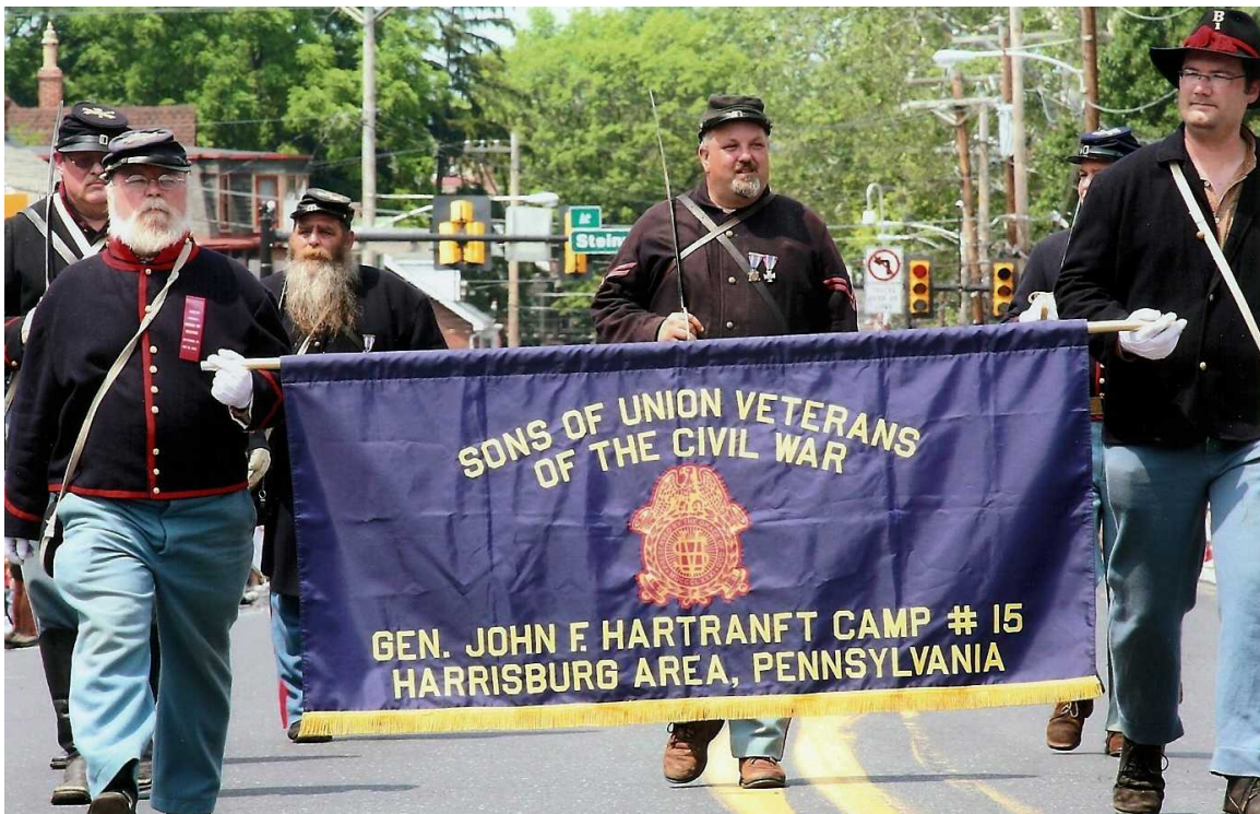
CAMP 15 APPEARED ON COVER OF THE GETTYSBURG TIMES FOR THE 2012 MEMORIAL DAY EVENTS IN GETTYSBURG, PENNSYLVANIA!

Come One, Come All - Ladies & Brothers, & Family & Friends, all are welcome to our Camp meetings at the National Civil War Museum and field trips at-large -- Bring your camera!