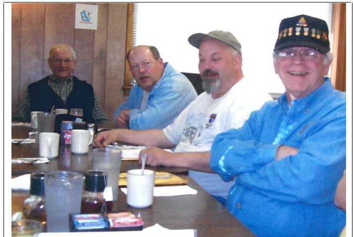
Grey hair abounds on these Camp Brothers filling up for their annual trek to pay tribute to veterans at rest in Harrisburg cemetery.