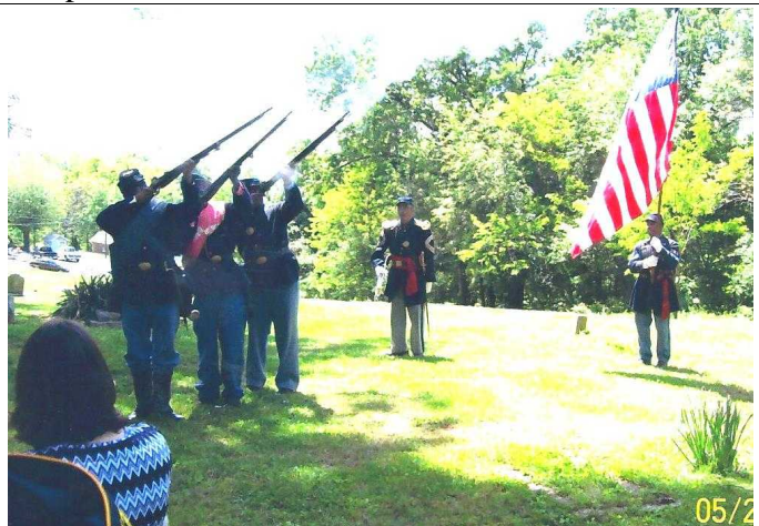
Memorial Day 2014 at Midland Colored Cemetery, Steelton, PA, 3d USCT color guard on duty from Philadelphia, PA