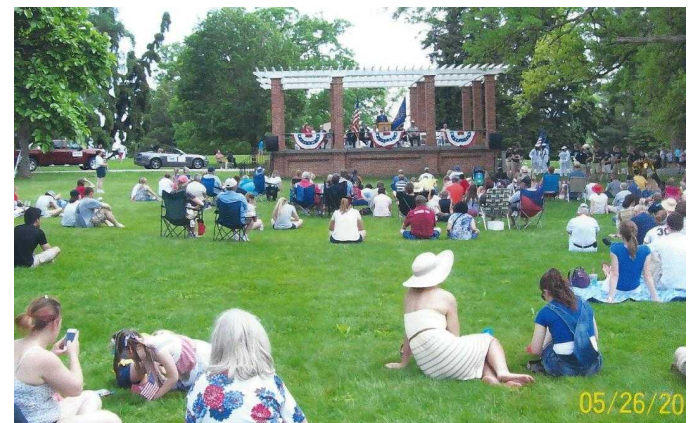
National Cemetery at Gettysburg, PA