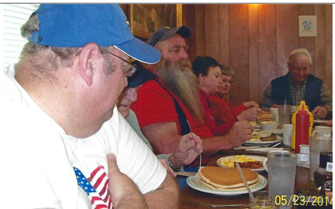
Camp Brothers and Sisters enjoying breakfast prior to convoying to historic Harrisburg Cemetery, for Memorial Day weekend 2014.