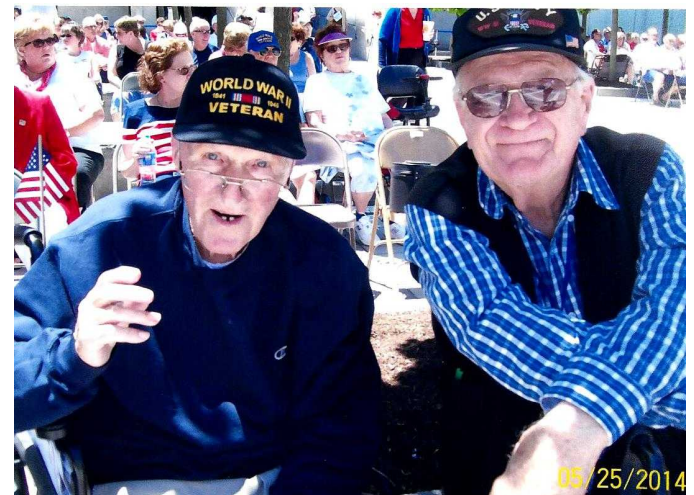
Two mature veterans sharing in the activities at Indiantown Gap National Cemetery's annual ceremonies for Memory Day, near Annville, PA.

August and September 2014 Hartranft Herald Camp 15 Sons of Union Veterans of the Civil War