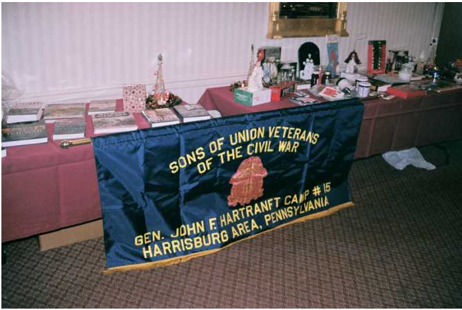
Camp Banner displayed on bingo gift table.