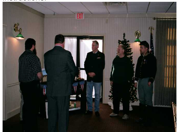
Officers for 2009 during installation.