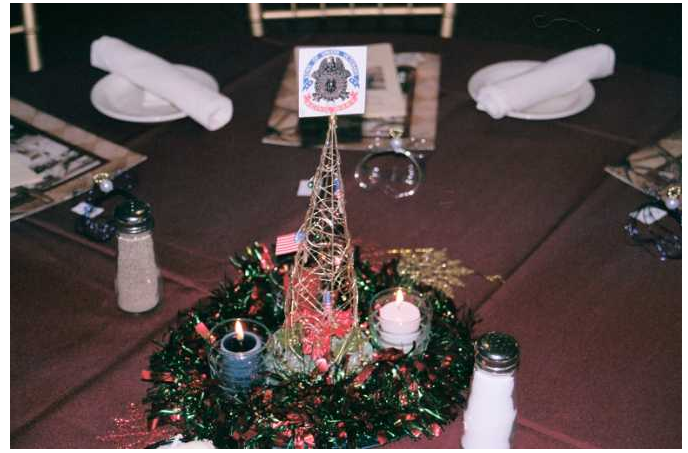
Doc Hollidays table setting above with Dot Kline's center pieces.

December 7, 2008 Doc Holliday's at New Cumberland, PA