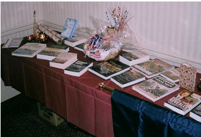
Books available to bingo winners.