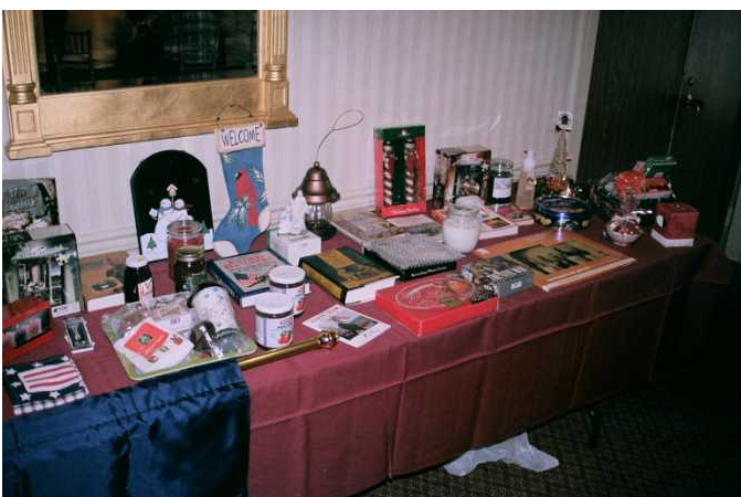
Additional bingo gifts for winners.

We'll see all of you at the January Camp meeting in 2009.