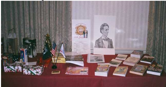
VARIETY OF ITEMS ON 1 OF 3 BINGO GIFT TABLES

In the freezing rain on Sunday December 13 at Doc Holliday's New Cumberland, we had: