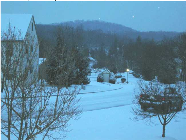
SCENE IS FROM A NEIGHBORHOOD IN HUMMELSTOWN, NEAR HERSHEY, PA.

Merry Christmas and Happy New Year to you and yours from the staff and management of Camp 15, Auxiliary 7, and your Hartranft Herald reporters, writers, graphic-artists, type-setters, Mr. Spell-Checker, and all the CPAs.