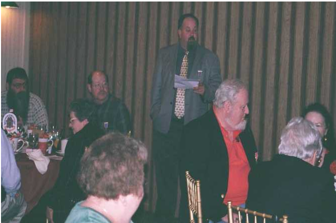
COMMANDER'S KLINE'S LAST WORDS? YOU THINK DI'NOZZO? CAMP 15 CHIMES: NEVER! 2010 CAMP HOLIDAY BANQUET HAS ALREADY BEEN SCHEDULED WITH DOC HOLLIDAY'S FOR SUNDAY, DECEMBER 12, 2010 AT HIGH NOON.