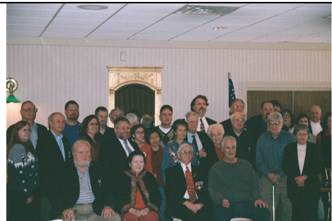
THE ASSEMBLY GROUP PHOTO