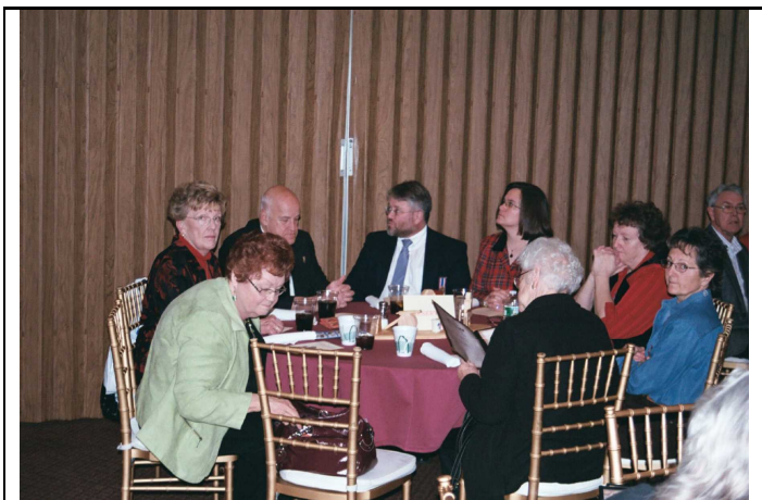
HURRY UP AND WAIT – AN OLD ARMY ADAGE – GROUP WAITING FOR THE SUPERIOR DINNER TO BE SERVED.