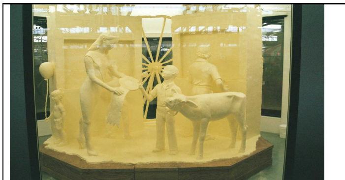
ANNUAL BUTTER DISPLAY DEPICTING AWARD WINNERS.

The annual Pennsylvania farm show is the largest event of its kind on the east coast! The original agriculture event was held on the grounds, just north of Harrisburg, where civil war Camp Curtin recruited and trained men for the war machine of 1861 to 1865.