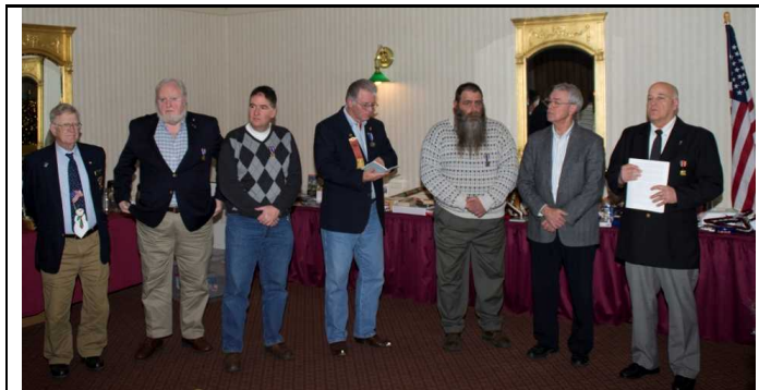
INSTALLATION REMARKS BY CHAPLAIN, CENTER!