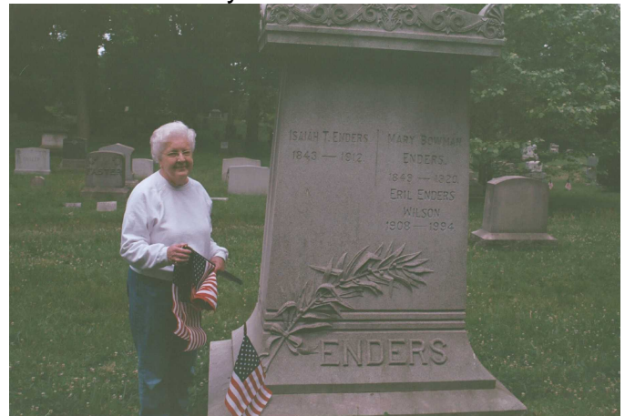
2011 PATRIOTIC AUDREY ATTENDING TO A VETERAN'S SITE ON MEMORIAL DAY AT HARRISBURG CEMETERY.

drum on display at State Museum, family chair made by a civil war veteran ancestor and their collection of many civil war artifacts.