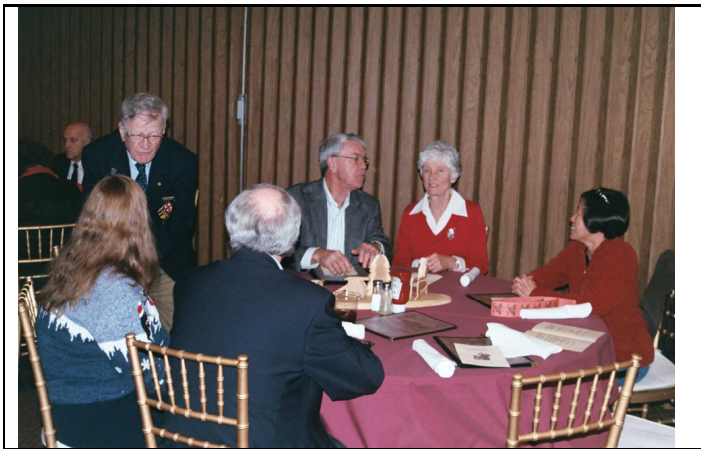
VARIETY OF CAMP MEMBER'S FAMILY AND GUESTS