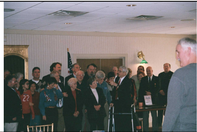
NOW LISTEN TO THE OLD SARGE. ⬆