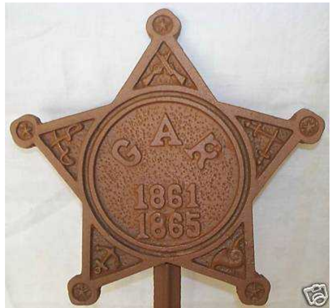
Grand Army of the Republic grave marker!