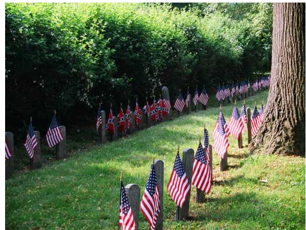
ABOVE, CIVIL WAR VETERANS' IN SECTION Z!