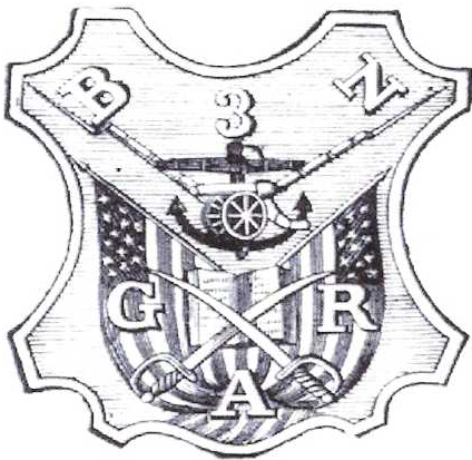
FIRST GAR MEMBERSHIP BADGE

Part 1 - The first badge adopted was a shield, upon which was engraved the insignia of the different arms of the army, the navy, and flags; also the letters 3. B. N. -- G. A. R., meaning "THIRD BATTALION" Grand Army of the Republic. (From the History of George Meade Post No One, Dept of Penna GAR Philadelphia 1889).