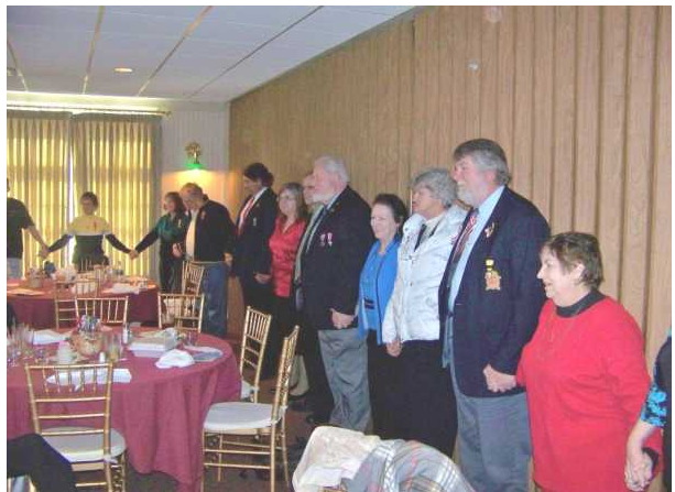
GUESTS ENGAGED IN TRADITIONAL "PENNSYLVANIA CLOSING".