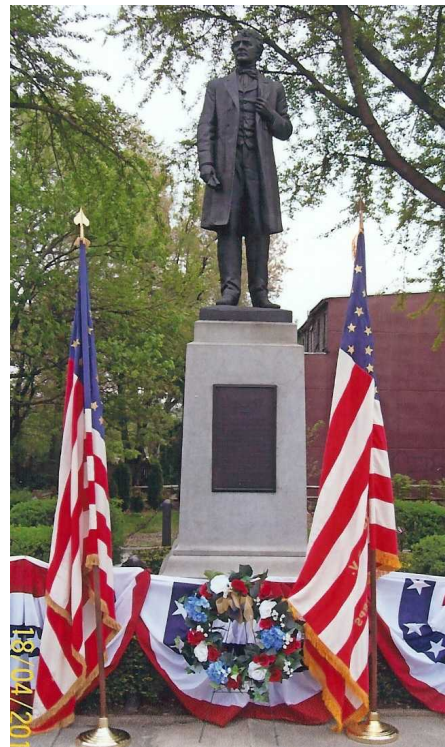
ONE OF FOUR STATUES OF ANDREW CURTIN! Sons of Union Veterans of the Civil War Harrisburg Gen. John F. Hartranft, Camp 15

opening of Camp Curtin in Harrisburg was celebrated. Camp Curtin, located adjacent to major northeastern rail lines, was among the Union Army's most strategic transportation centers and supply depots and served as a mustering in Camp for over 300,000 Union troops from several northern states during 1861-1865.