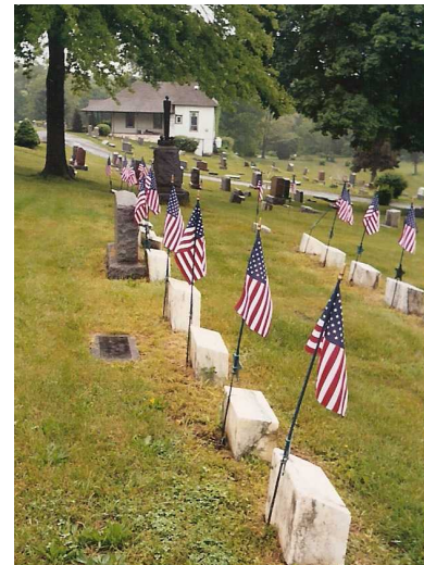
FILE PHOTO OF GAR POST 116 VETERANS PLOT AT PAXTANG CEMETERY, EAST OF HARRISBURG!

COMMENTS To see pictures and articles about Hartranft Camp 15