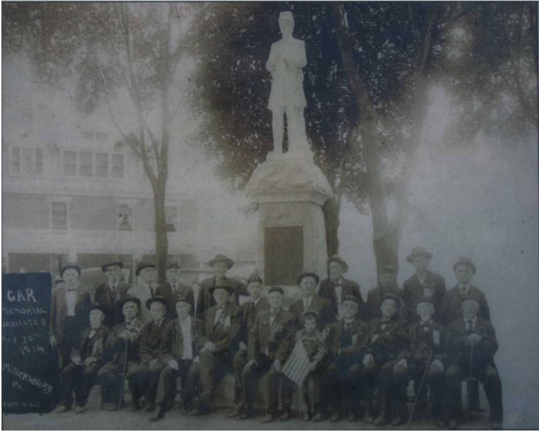
1914 grouping of the GAR members within the Millersburg area.