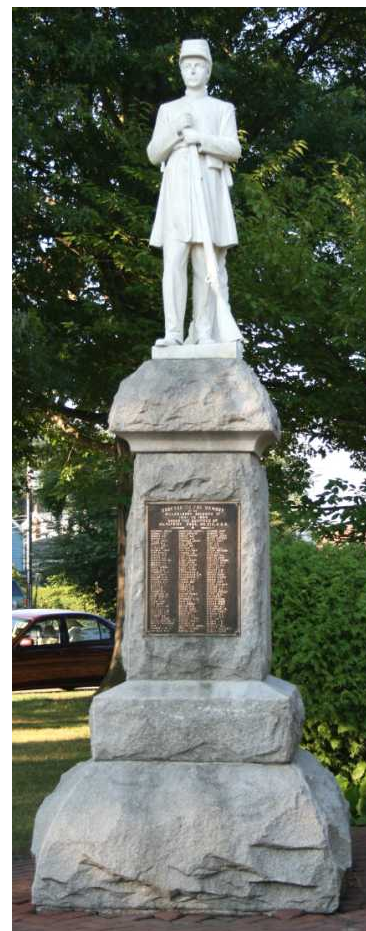
ERECTED TO THE MEMORY OF THE MILLERSBURG SOLDIERS OF 1861 TO 1865 UNDER THE AUSPICES OF KILPATRICK POST NO. 212, G. A. R.

The town of Millersburg in Dauphin County celebrated its 200 th birthday this past summer. One of the town's prominent landmarks is the Civil War Monument that was dedicated on May 30, 1914. The six foot-tall, 900 pound soldier and his base were made from Italian marble. G.A.R. Post 212 and the Millersburg Sentinel raised $740 to pay for the monument, as well as the $55 required to ship it from Italy. The bronze plaque on its base bears the names of 126 Civil War veterans from Millersburg and vicinity. Maybe you're related to one or more of these brave men.