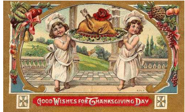
POSTMARKED IN COFFEYVILLE, KANSAS AND SENT TO IOLA, KANSAS CIRCA 1919.

Blessings to you and yours during this Thanksgiving Day period! May God continue to richly bless you and yours during this season!