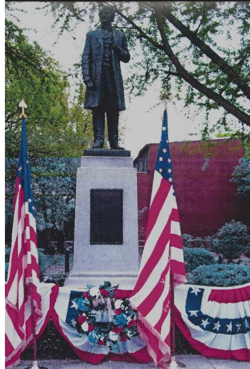
Andrew Curtin statue at Camp Curtin Park.