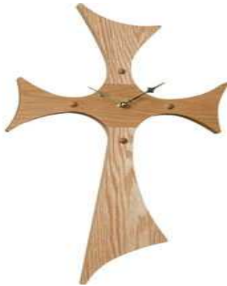
Time for Prayer Clock