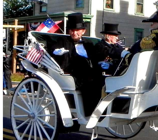
THE CIVIL WAR DUO ON REMEMBRANCE DAY NOVEMBER 19, 2011

I remember watching him standing in lines greeting people at numerous places and he always had one question as he shook hands "where are you from?" Then he would reply some tidbit of information of the 1860 period pertaining to a person or event that pertained to where the people were from. This also included people from foreign countries. One year we were on a special tour with a group of Civil War reenactors to Washington D.C. and meet a group of school students from Japan, at the National Capital, I believe every one of them took a picture home of them and President Lincoln. At the White House all the guards greeted President Lincoln. For years we paraded side by side in the Remembrance Day parades, till walking became a problem.