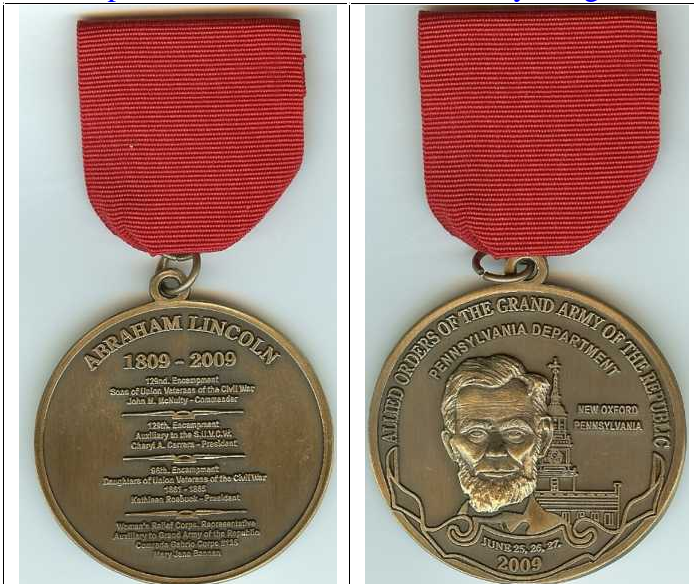
PENNSYLVANIA'S 2009 ENCAMPMENT BADGE PROVIDED TO ALL ENCAMPMENT PARTICIPANTS!

What did you do this summer, carries-on with data about the Pennsylvania Department's 2009 Encampment at New Oxford near Gettysburg!