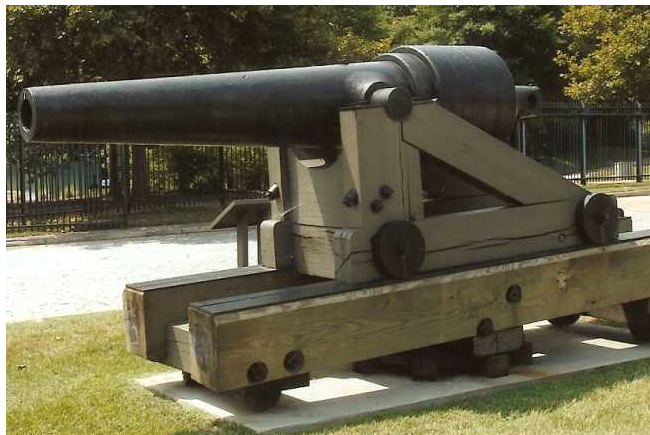
ONE OF THE MANY CANNONS ON DISPLAY AT TREDEGAR.