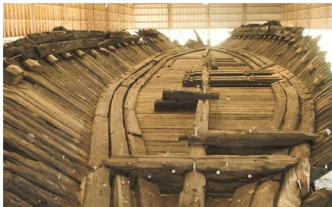
THIS PHOTO SHOWS THE ORIGINAL HAUL OF THIS VESSEL.

During the summer of 2009, I toured North Carolina and the Commonwealth of Virginia looking at a variety of civil war related places and sites. The first site I visited was the life-size model of the CSS Neuse.