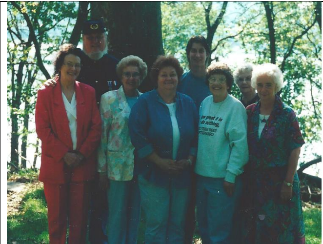
Camp 15's Auxiliary #7 ladies and guests!