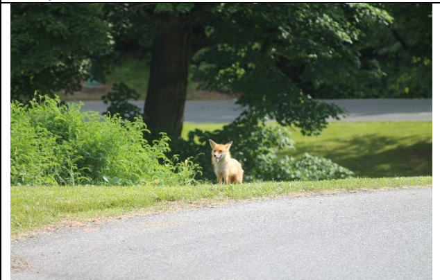
Park Wildlife doesn't know what to make of the noise! One of Harrisburg's official pets on patrol at the Park!