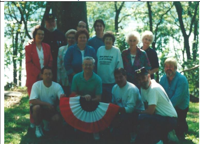
Combined pose! Susquehanna River in the background near Fort Hunter