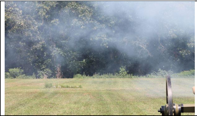
And the black powder smoke blows towards Boro of Penbrook from high atop Reservoir Park!