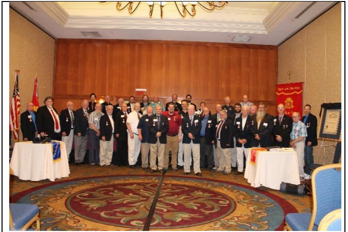
Image from Pennsylvania Department Encampment June 28, 2019 at King of Prussia.

Following the installation of 2019-2020 officers for our Department of Pennsylvania, all those still present, were captured, digitally! Quik, someone name all personnel in this photo!