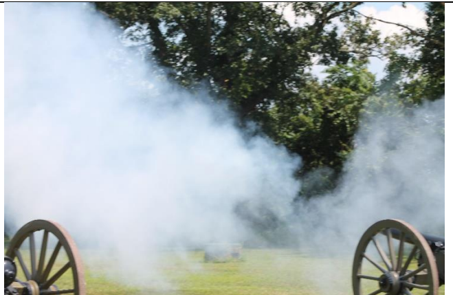
Thunder and smoke at Reservoir Park