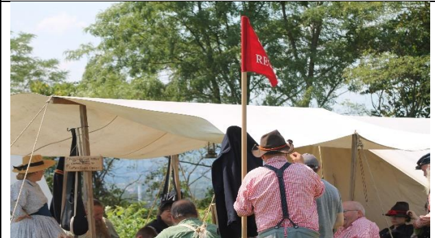
Camp Life and below