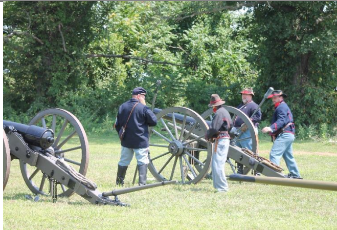
Cooper's Battery preparing to fire!

Weekend of July 27, the NCWM sponsored Thunder on the Hill , 2 Batteries, Thompson's and Cooper's demonstrated to the public, "life within a battery of 1860s"!