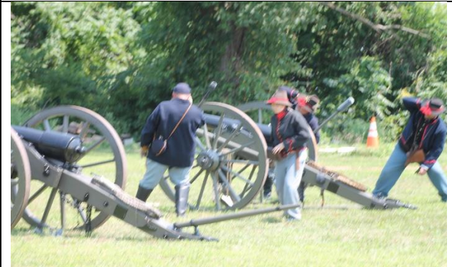
And an instant reply!