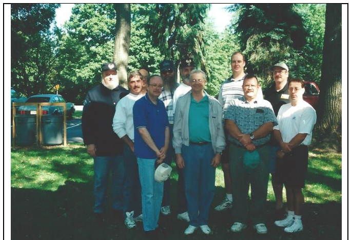
September 1999 camp picnic -- at Fort Hunter! Included dual members from Camp 112!