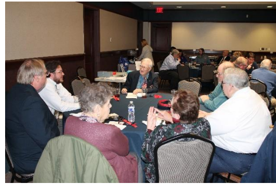
Around the ballroom: