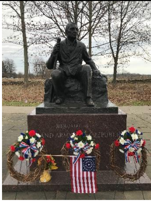
Tribute from Allied Orders