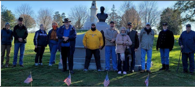
Personnel who participated in the placing of flags upon the cemetery.