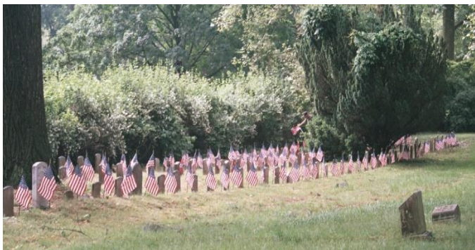
Garden of Stones , tribute to fallen veterans of the Civil War! File photo!

Following that visit, we convoyed over to the East Harrisburg Cemetery along Herr Street and cleaned up the gravesite of our camp auxiliary's late leader, Mary Jane Bannan. Her site was neglected and we leveled it, applied fresh topsoil and topped it with grass seed.