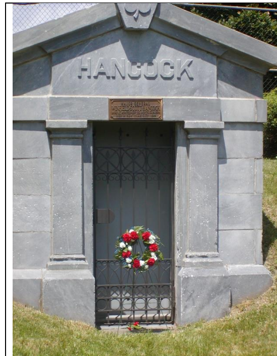
2011 visit to cemetery at Norristown