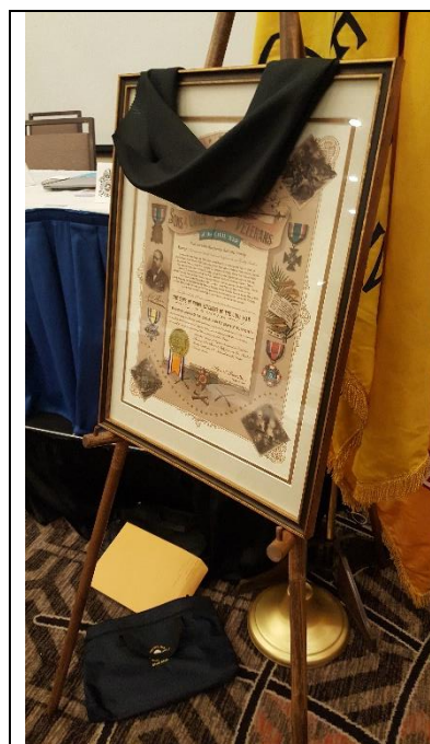
This easel is much easier to transport to a National Encampment. The national charter [shown above] was draped for the annual memorial service

The award was for PA recruiting the most, new brothers, under the age of 40. 2021-2022.