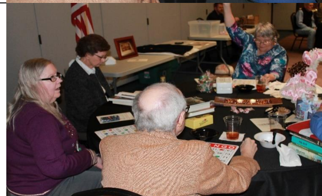
Enjoying holiday bingo