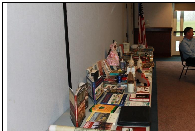
Many items offered on our holiday bingo activity. Bring 5 items and win at bingo 5 times.