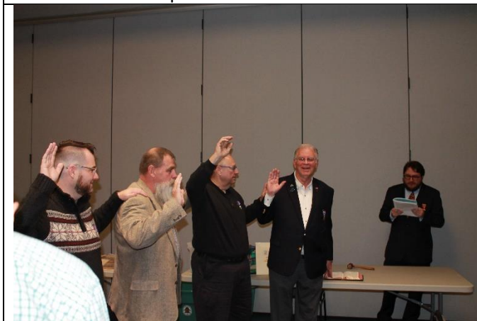
Brothers in attendance taking the oath.