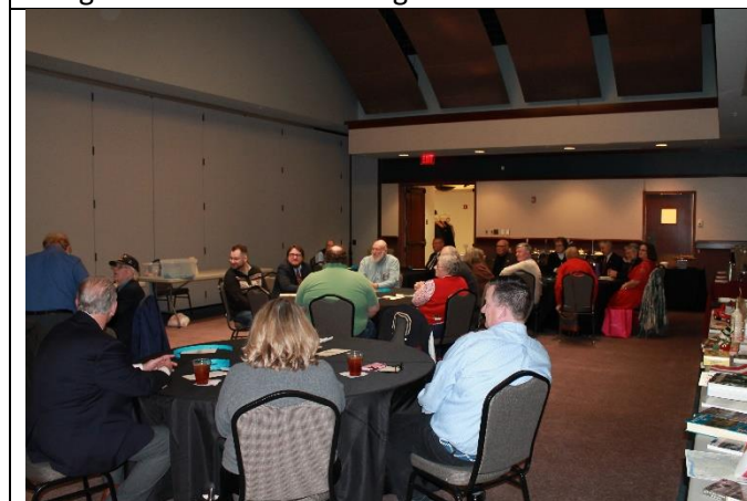
The group above