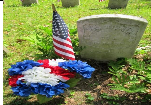
Flowers offered in remembrance of civil war veterans laid to rest in old cemetery.