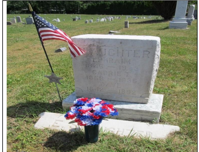
Brothers below paid tribute to Ephraim Slaughter, the last Civil War Veteran, of the city of Harrisburg.