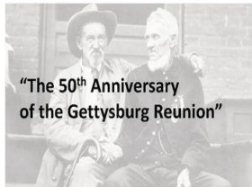
"The 50 th Anniversary of the Gettysburg Reunion"