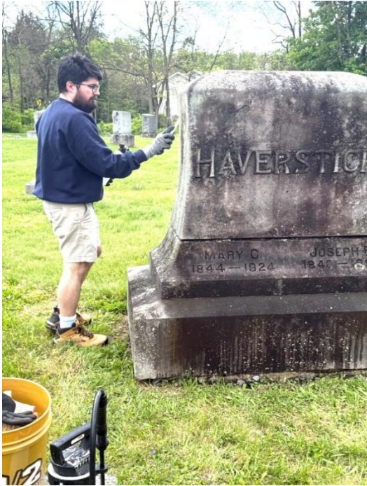
Harrisburg historic Cemetery events:

dedicated to the Civil War dead, where only 35 have been identified. Well done brothers!